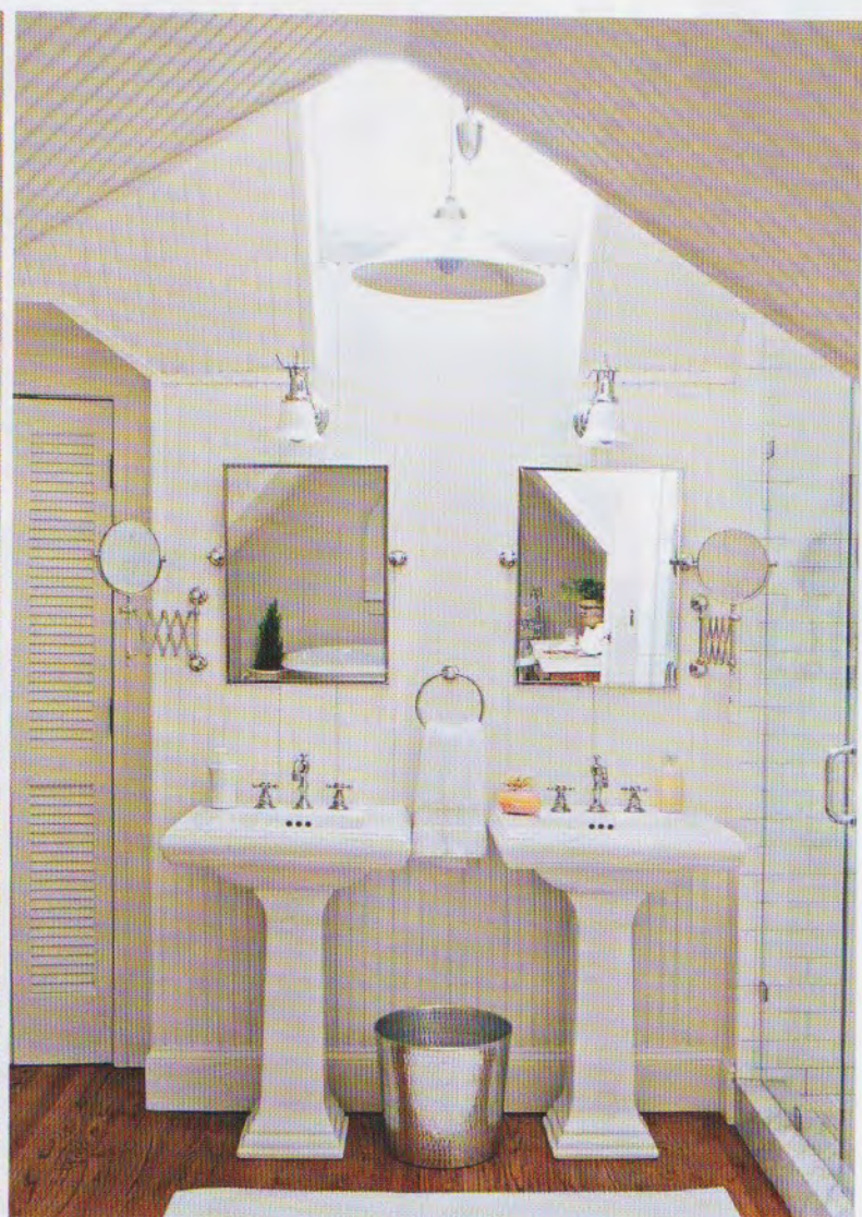
OPPOSITE LEFT: The renovated kitchen, with white-painted cabinets and statuary marble countertops, is in keeping with the age of the house. Painting the backs of the glass-front cabinets robin's-egg blue highlights the dishware displayed within. OPPOSITE RIGHT: Mix-and-match white and cream tableware from Nokie's extensive collection combines for a charming tabletop. ABOVE LEFT: A chandelier casts romantic light in the master bedroom. The four-poster's rich wood stands out against light walls and linens. ABOVE RIGHT: The bathroom's vintage-style pedestal sinks and light fixtures fit the look of the original house, built in the 1920s. Beaded board covers the walls and steeply pitched ceilings.